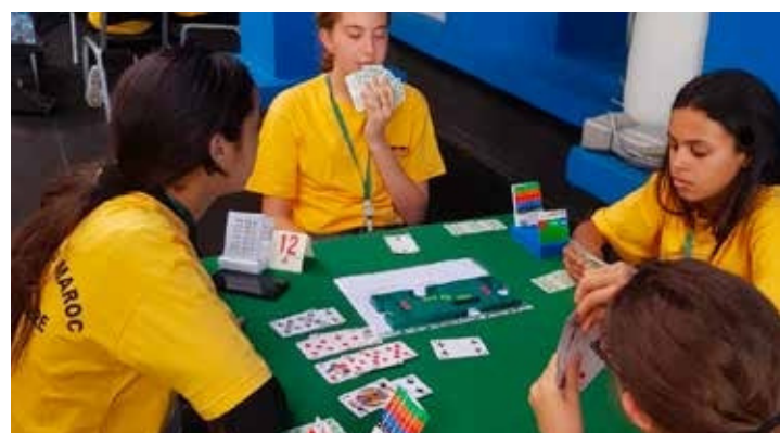
The moroccan school championship of bridge, 2019

>The educational quality of Bridge is recognized by UNESCO and by the international olympic committee and is taught in moroccan middle schools and highschoools.