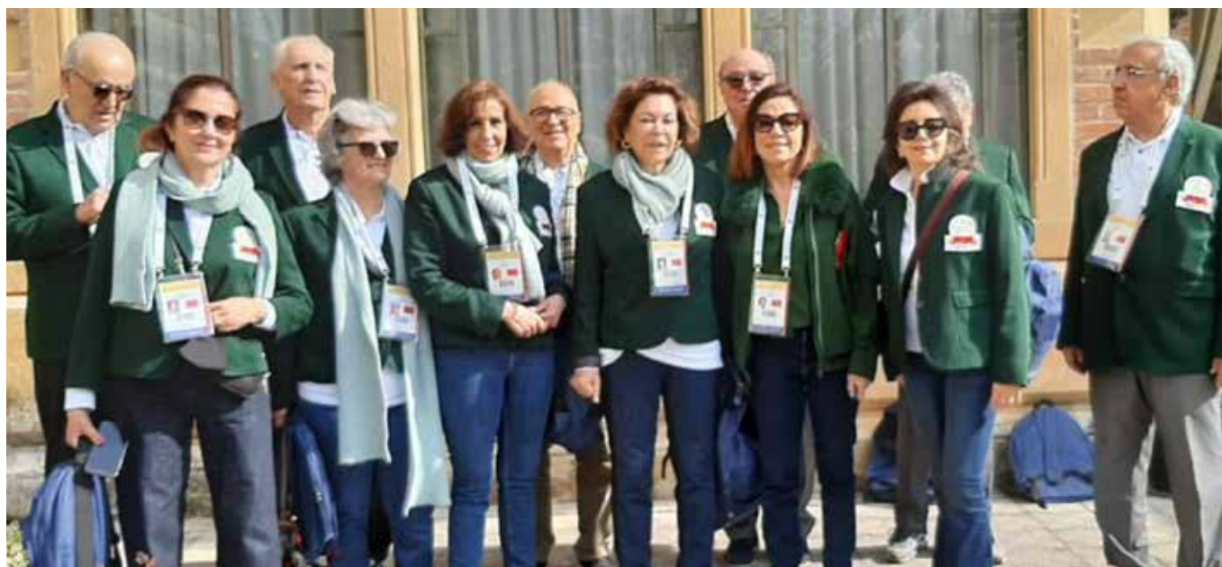
the national teams (lady and seniors) at the world championship of 2021 at Salsomaggiore, Italie